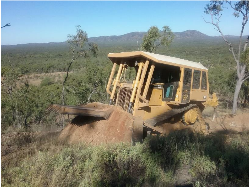
Figure 2. Access track construction on Mt Flora