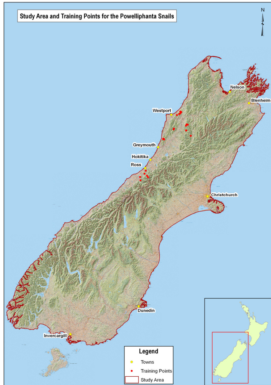
Figure 1. Study area outline of South Island with distribution of training points (orange circles).

Spatial modelling, in particular the weights of evidence method, requires training data to test the correlation between known occurrences of snails and the map data sets. The 22 point training data set for this study is based on the locations of snails from five taxa namely: Powelliphanta “Kirwans”, Powelliphanta Victoria/Brunner Ranges, Powelliphanta “patrickensis”, Powelliphanta gagei and Powelliphanta rossiana rossiana that have been recorded by DOC. The locations of the training data points are shown in Figure 1.